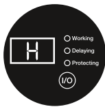
Over voltage warning